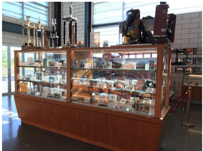
Fire Department Headquarters Display

Commerce City Civic Center – 7887 East 60 th Avenue